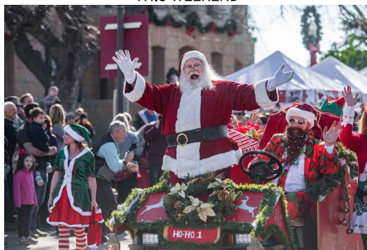
Santa Claus rides with the Georgetown Beard Club near the conclusion of the parade during the 39th Annual Christmas Stroll held in downtown Georgetown 2019.