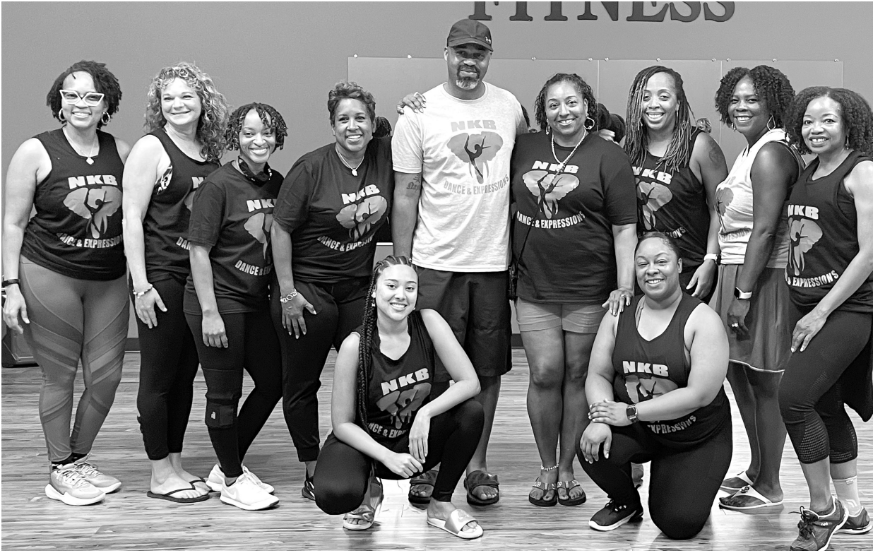
The staff of NKB Dance & Expressions. The studio, located at 610 North Austin Avenue, opened its doors to the public on July 24.