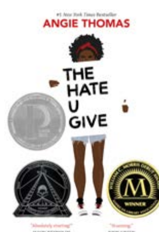
The Hate U Give by Angie Thomas Teens

From National Book Award-winning author Ibram X. Kendi comes a new approach to understanding and uprooting racism and inequality in our society and in ourselves. The New York Times calls it a book that “may, in fact, be our best chance to free ourselves from our national nightmare.” Named one of the best books of the year by The New York Times Book Review, Time , NPR , and The Washington Post .