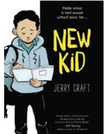
New Kid by Jerry Craft Grades 5-8

Starr Carter, 16, moves between two worlds: the poor neighborhood where she lives and the fancy suburban prep school she attends. The uneasy balance between these worlds is shattered when Starr witnesses the fatal shooting of her childhood friend Khalil. A topical, powerful young adult novel by a brilliant new author National Book Award Longlist title and winner of the Boston Globe-Horn Book Award, Coretta Scott King Honor, Michael L. Printz Honor, and William C. Morris Award.