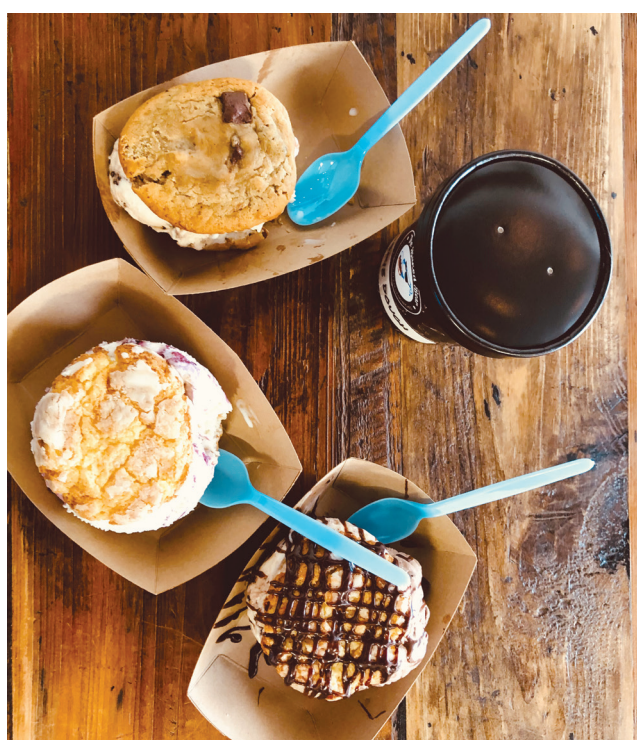
The Baked Bear serves customized dreamy, creamy ice cream sandwiches.

The Baked Bear was started in San Diego by college buddies who decided customized ice cream sand-