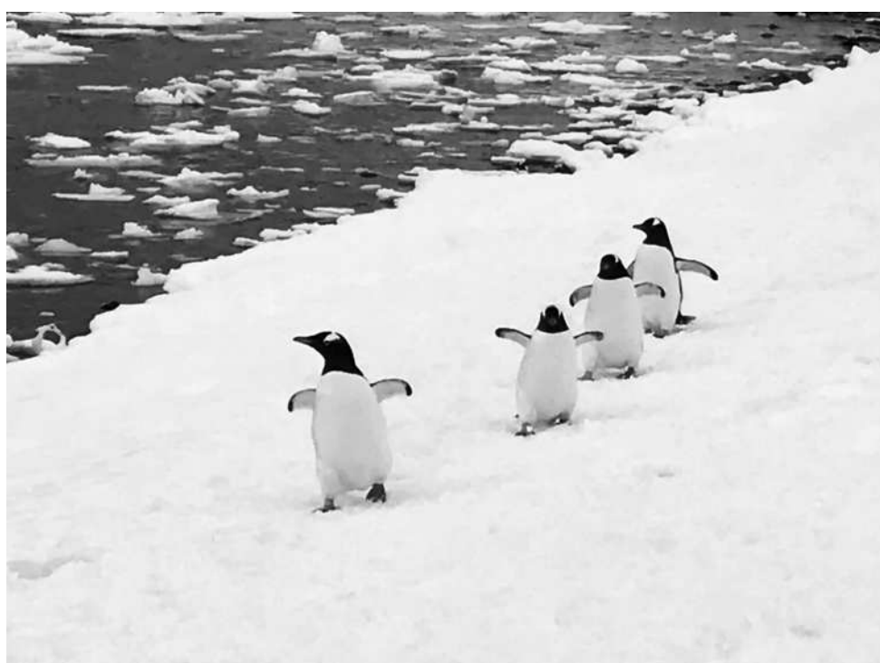
See "Follow the Leader" by Ellen Greeney featuring Gentoo penguins in Antarctica at 620 Gallery & Studio's "Composition in White" exhibit through June 11 in Round Rock.