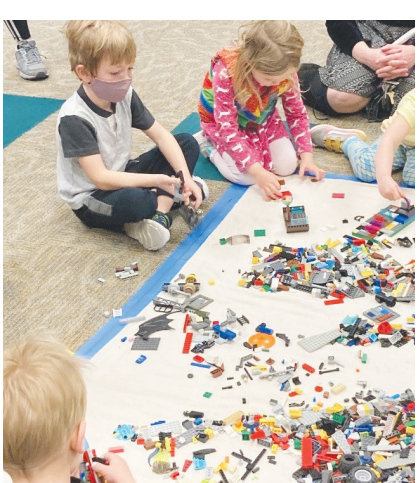
ESTEAM LEGO events are always popular at the Library.